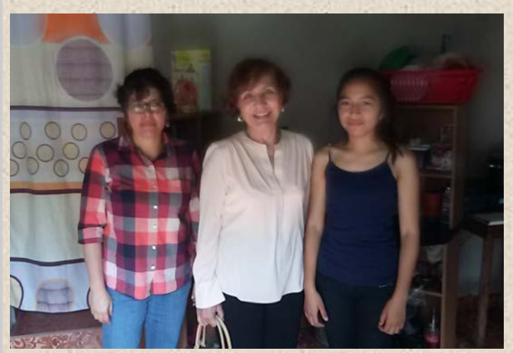
A godmother with her godchild