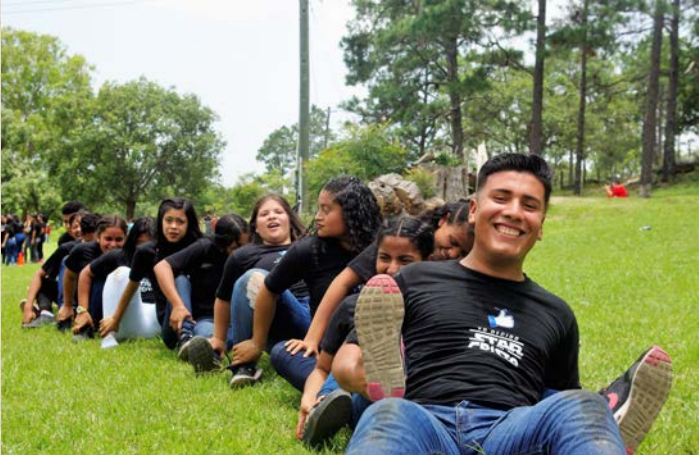
Sport activities and ...