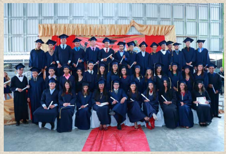
Grade 11th B