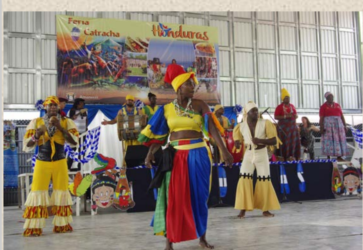
Presentation of dances by a group of garifunas