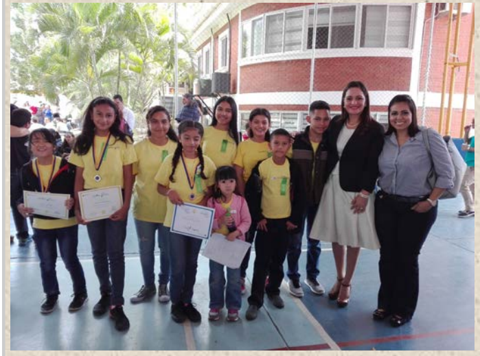
Participation in the spelling bee