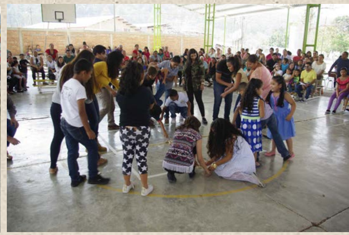
Parental education and information meetings