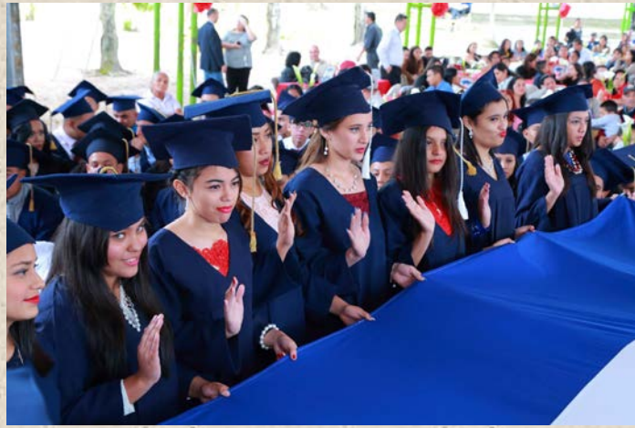
Pledging to the Flag