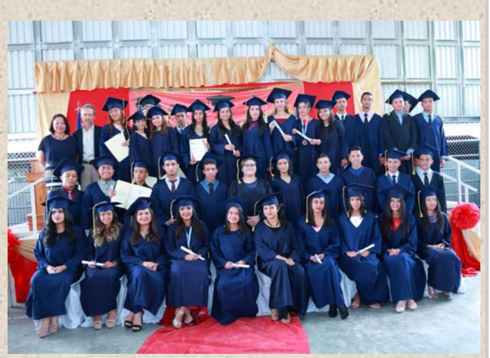
Grade 11th A