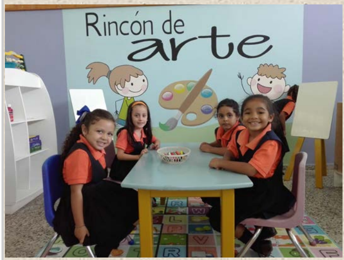
Kindergarten students in the corner of art