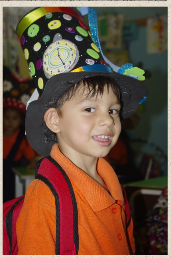
Boy on hat day