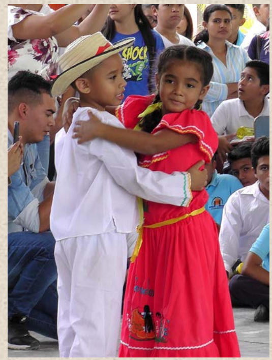
Even our smallest gave a dance presentation