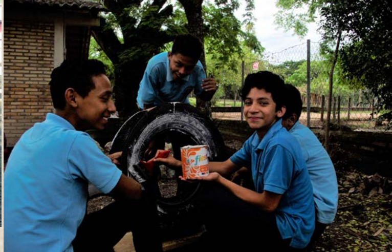
When painting old tires