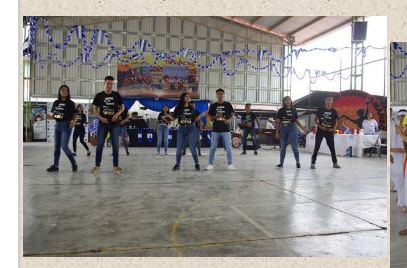
The 4th grade during their performance