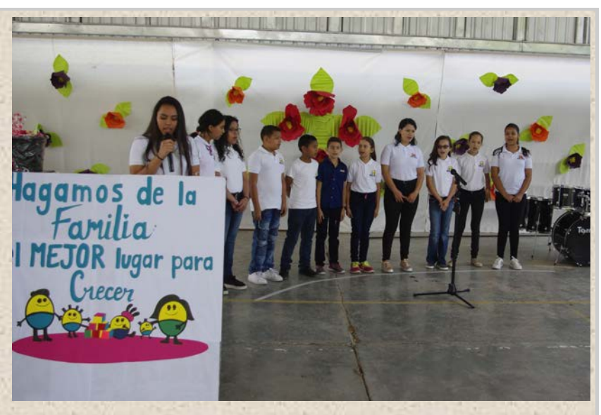
Presentation of our students on the day of the family