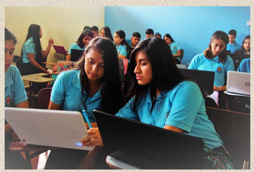
Grade 11th students in the classroom