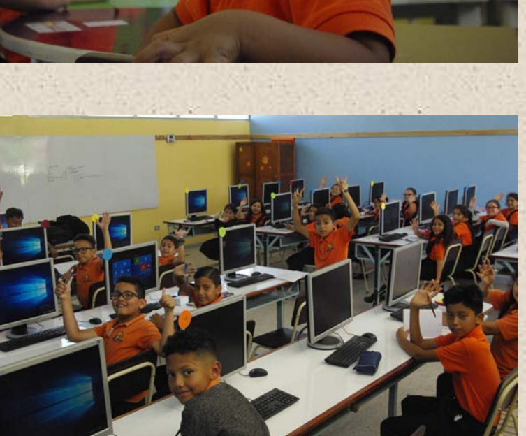
4th grade in the computer lab