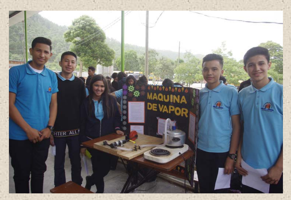
Some of the projects presented by our students