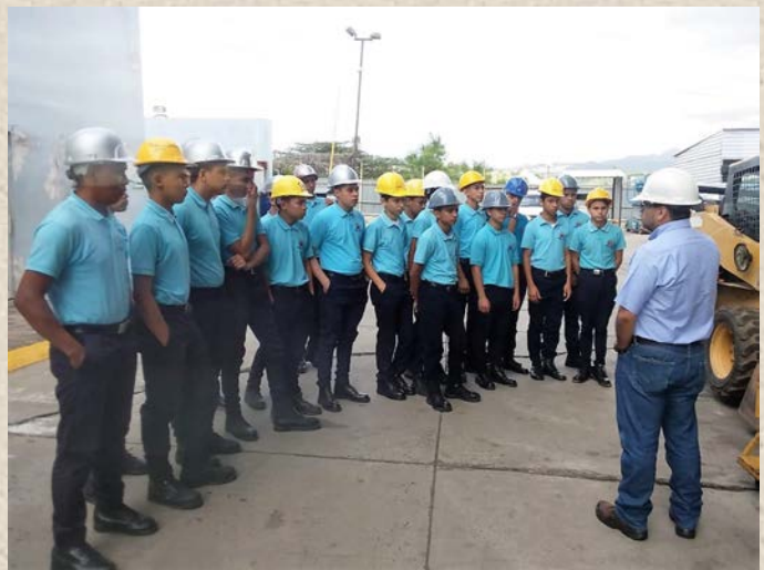
The car mechanics and industrial mechanics visit companies