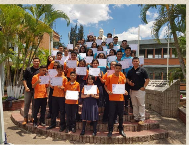
Participation in the mathematics contest